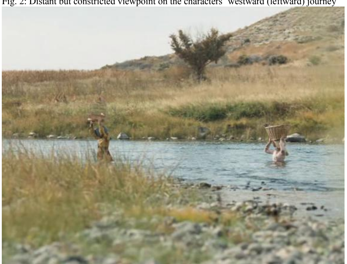
Fig. 2: Distant but constricted viewpoint on the characters' westward (leftward) journey

The slow depletion of water supplies and gradual exhaustion of the characters are mirrored in the absence of spectacular features: the limited film format, minimalist narrative, sparse dialogue, music and action, and slow pace (with long takes of 10 to 30 seconds), refuse the easy pleasures of mainstream cinema and force upon the viewer the slow progression of an obstinate wandering through nothingness, with no guarantee of ever arriving somewhere. Some critics (Dan Kois) complained about how exhausting the film was, probably out of cultural fatigue at having to labor through yet another scarcely rewarding art film (Kois 2011), and Reichardt's style has often been described as dry and anti-sensualist. In Meek's Cutoff, however, it serves to express a sense of the consuming dimension of the characters' journey.