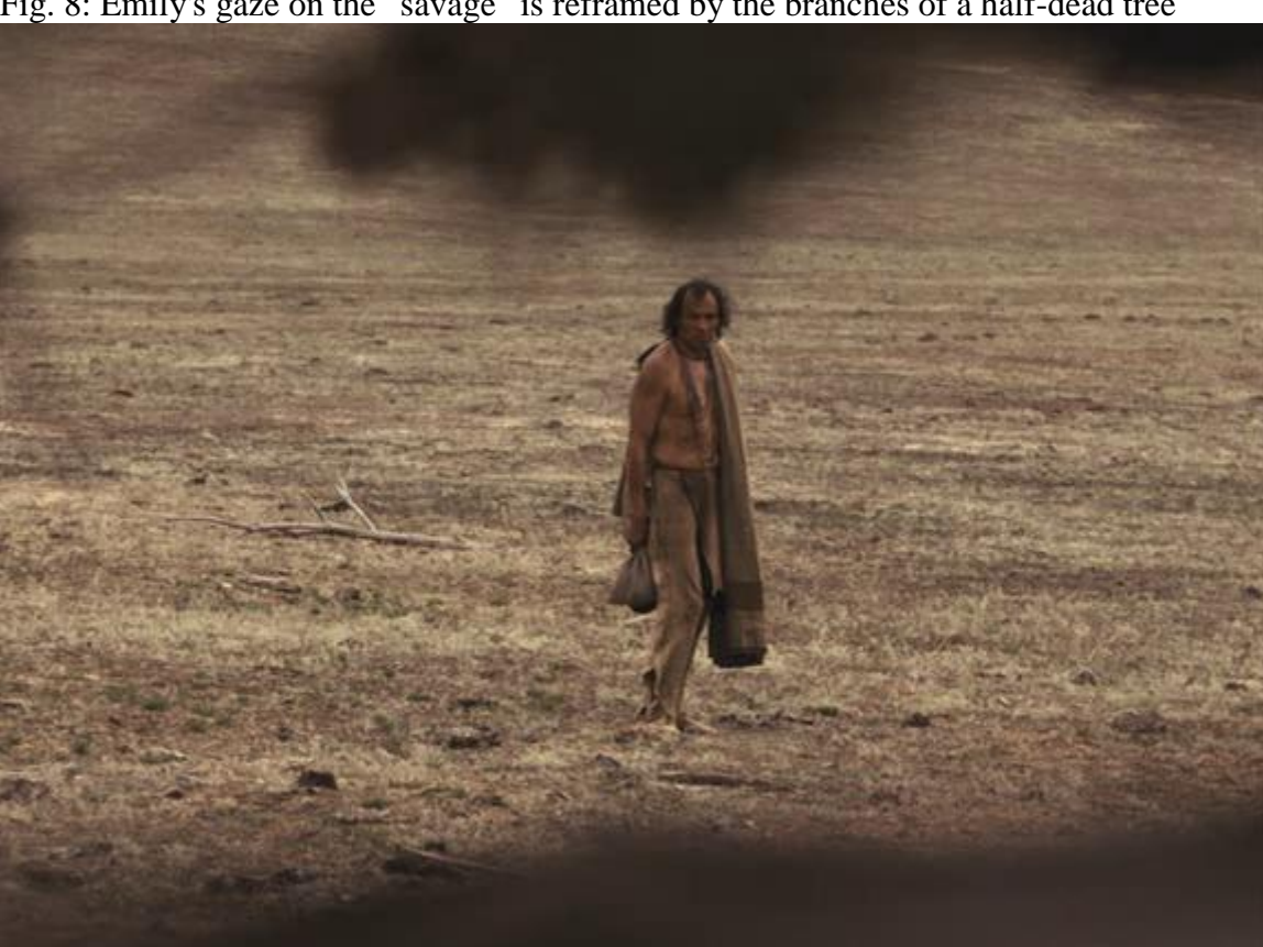
Fig. 8: Emily's gaze on the "savage" is reframed by the branches of a half-dead tree

deciding on whether or not to continue following the Indian, her gaze on the "savage" is obstructed and reframed by the branches of a half-dead tree, whose virtual apparition in the concluding sequence may or may not be a sign of salvation (Fig. 8). One is tempted, as White argues (224), to see in this thematization of limited perspectives the white female director's sense of her own particular viewpoint when shooting the history of the West.