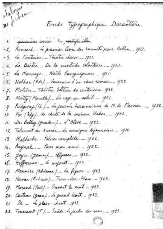
Figure 1. Fonds typographiques Darantière .