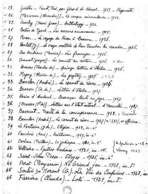
Figure 2. Fonds typographiques.