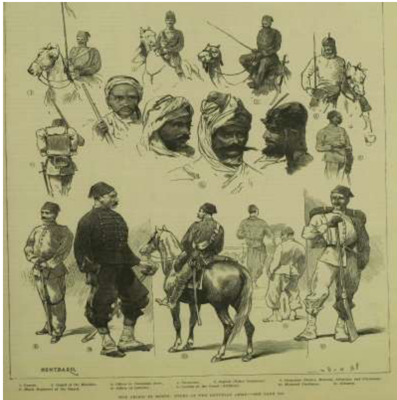
Image 3: Montbard. (1882) The Crisis in Egypt: Types of the Egyptian Army . Available at 'The Crisis in Egypt: Types of the Egyptian Army' (1882) Illustrated London News , 03 Jun, [533].

However, the one on the constitution of the Egyptian Army was worth a military document on an enemy's army (image 3). It was published out of a military crisis caused by the officer Arabi Pasha who presented a list of political claims concerning the Egyptians in the army and asked for reducing foreign influence in his country. The illustration of Arabi Pasha below and depicting him as ' The would-be dictator of Egypt ' was far from reassuring readers about the intentions of the man. The debate on the military intervention of Britain in Parliament and the hesitation of The Prime minister Gladstone was faced by illustrated arguments which favoured the military intervention.