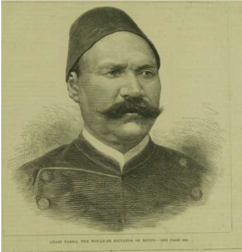
Image 4: Illustrated London News . (1882) Arabi; The would-be dictator of Egypt. Available at 'The Crisis in Egypt' (1882) Illustrated London News , 10 Jun, 562+,

Graphic arts and photography participated in the creation of a new orientalism; they conveyed and reinforced the idea that the west was in a better position to show and exhibit the Orient because of its scientific advance. Newspapers gave illustrations and photographs a political dimension and propelled the orient into a geopolitical context. What a photograph denoted was more related to political decisions, colonial and economic interests. The Orient became the Middle East and Egypt became the Egyptian Question or the Egyptian crisis and a source of instability and conflicts, thus leading to the demystification of the 'Orient'. The publication of sketches or photographs on Egypt, while dealing with the political and military situation in Egypt, gave the Orient a dimension far from the fantasies conveyed through the commercial photographs. As far as Egypt is concerned, the images