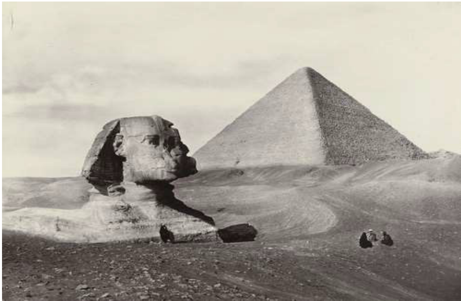
Image 1 Great Pyramid and Sphinx. Egypt and Palestine / photographed and described by Francis Frith.

By the nineteenth century, Egypt was part of the Ottoman Empire but led by a Viceroy, Mohammed Ali Pasha [8]. He launched a movement of reforms which prevailed the occidental model in the administration of the country. He developed the agriculture and the local industry. He encouraged modern sciences and established new Western style of schooling. The changes that occurred in Egypt were certainly noticed and felt by the artists who were in direct contact with people but were not present on their photographs. The early Victorian photographers such as Cramb Brothers, Francis Bedford and Francis Frith tried to capture an Orient ready to receive the new ideas of Europe. Some of them belonged to the Anglican Church so their photographic images such as Frith, F (1857) reflected the desire to find the original world as described in the Bible and preserve it.