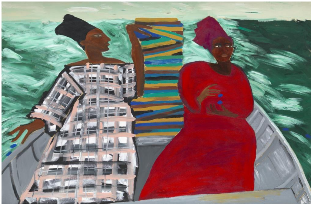
Lubaina Himid, Between the Two my Heart is Balanced , 1991, Tate Gallery, London. https://www.tate.org.uk/art/artworks/himid-between-the-two-my-heart-is-balanced-t06947