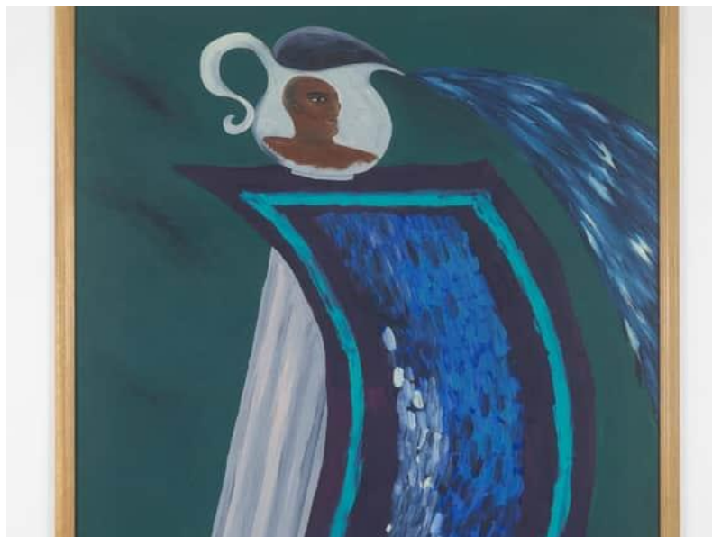
Lubaina, Himid. Memorial to Zong , 1992, Lancaster Maritime Museum. England. https://ibaruclan.com/exhibition-lubaina-himid-memorial-to-zong-at-lancaster-maritime-museum/