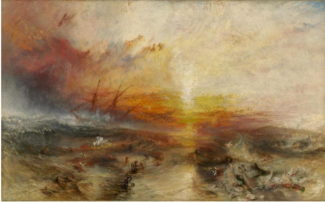
J.M.W. Turner, Slavers throwing overboard the Dead and Dying—Typhoon coming on (The Slave Ship) , 1840, Museum of Fine Arts, Boston. https://customprints.mfa.org/detail/476114/turner-slave-ship-slavers-throwing-overboard-the-dead-and-dying-typhoon-coming-on-1840