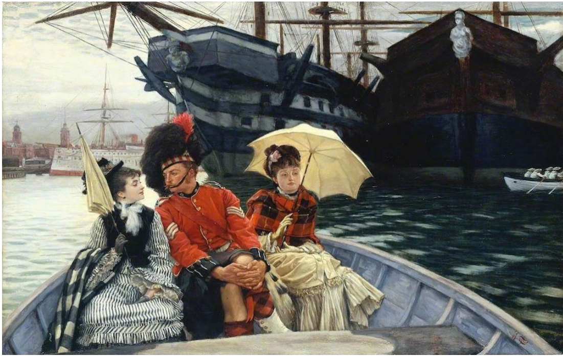
James Tissot, Portsmouth Dockyard (Between The Two My Heart is Balanced) , 1877, Tate Gallery, London. https://www.tate.org.uk/art/artworks/tissot-portsmouth-dockyard-n05302