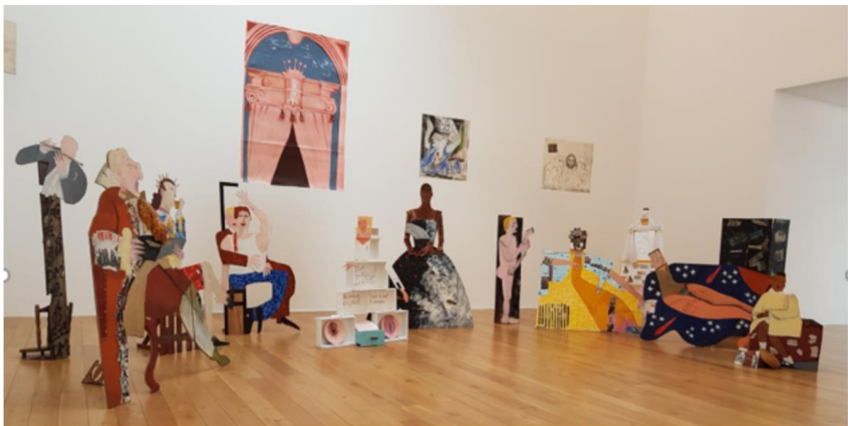
Lubaina Himid, A Fashionable Marriage , 1986, Tate Gallery, London. https://static1.squarespace.com/static/5797f07bf5e231d942a26c72/t/61b728f204b54a083003f127/1639393591383/Lubaina+Himid+Fashionable+Marriage.pdf