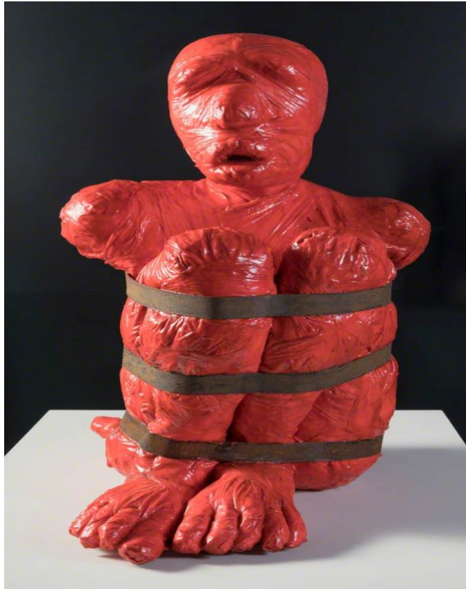
Francois Piquet, Timalle . 2017, International Slavery Museum, Liverpool, England. https://artuk.org/discover/artworks/timalle-288028