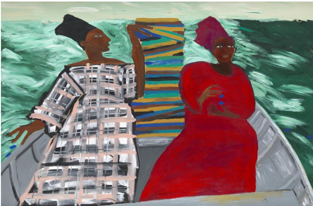
Lubaina Himid, Between the Two my Heart is Balanced , 1991, Tate Gallery, London. https://www.tate.org.uk/art/artworks/himid-between-the-two-my-heart-is-balanced-t06947