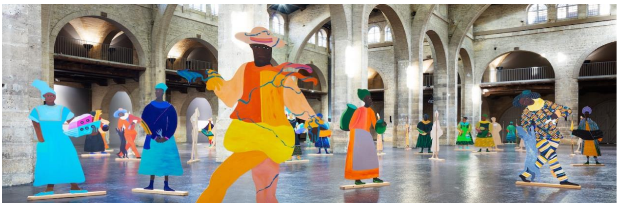
Lubaina Himid, Naming the Money , 2004, CAPC Bordeaux. https://www.capc-bordeaux.fr/agenda/expositions/lubaina-himid-naming-money